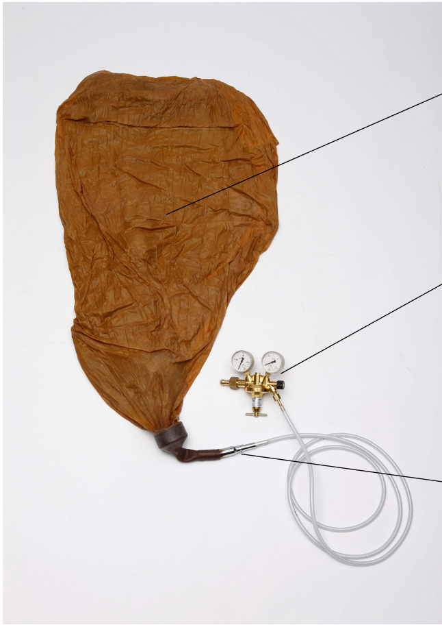
1700 g Weather balloon